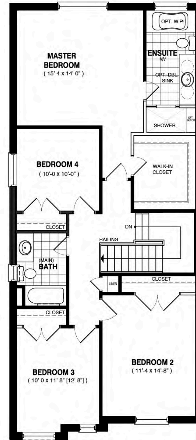
Second Floor Elevation A